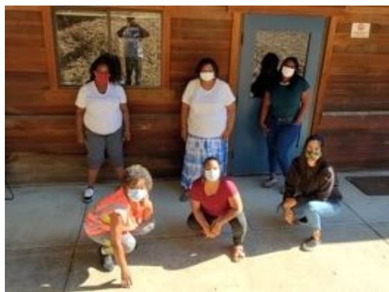
The EFM Forum of 2020 and The Marin City Cohort

Special thanks to Drawdown: Marin, Organizing for Action Marin (OFA), and Sierra Club for co-sponsoring Healthy Soils and Critical Thinking Forums, and providing funds for a Forum 2020 scholarship.