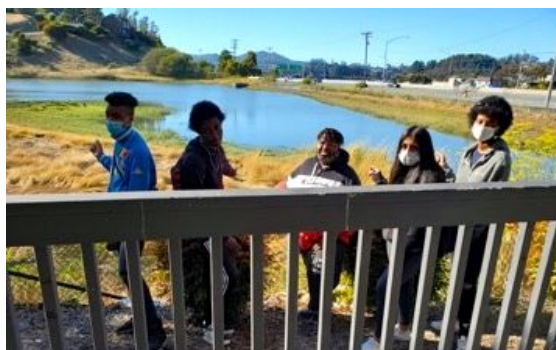
Shore Up Marin City community members checking out the pond and park site that will be revitalized.

Shore Up Marin City (SUMC) is an environmental justice program advocating for equitable inclusion, planning and emergency preparation. Areas of focus are climate change, sea level rise, water quality, resilience, habitat restoration, intergenerational leadership development, racial injustice and advocacy. Youth are encouraged to share their voice and vision as well.