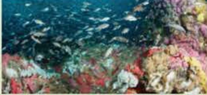
Cordell Bank Marine Sanctuary

Protecting Our Oceans: Perils and Progress in California , held at the Marin Art & Garden Center on April 25, included both 'youth' and 'adult' speakers who offered expert knowledge on the pollutions in our oceans and offered solutions at both an individual and policy level.